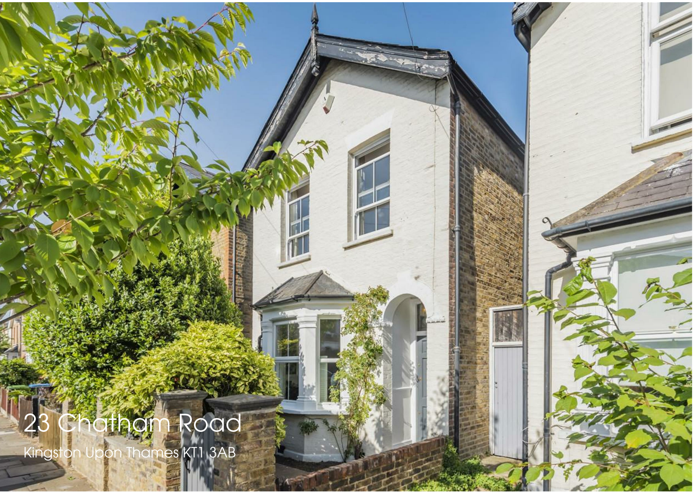
23 Chatham Road Kingston Upon Thames KT1 3AB

34 Richmond Road Kingston upon Thames Surrey KT2 5ED www.gibsonlane.co.uk Tel: 020 8546 5444